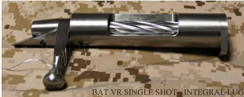
BAT VR SINGLE SHOT INTEGRAL LUG

3) VR (Rem. 700 SA inlet) integral recoil lug, spiral fluted, 308 bolt face single shot – email to order